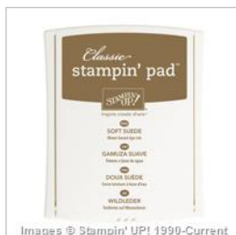
Soft Suede Classic Stampin' Pad - 126978