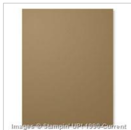
Soft Suede 8-1/2" X 11" Cardstock - 115318