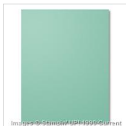
Mint Macaron 8-1/2" X 11" Cardstock - 138337