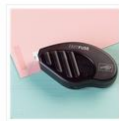
Fast Fuse Adhesive - 129026