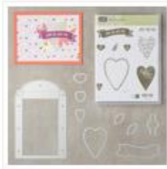
Sure Do Love You Clear-Mount Bundle - 145966