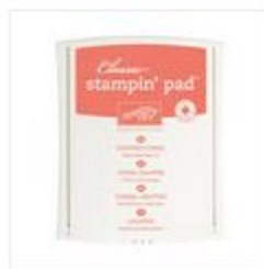
Calypso Coral Classic Stampin' Pad - 126983