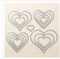
Sweet & Sassy Framelits Dies - 141707