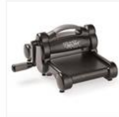
Big Shot - 143263