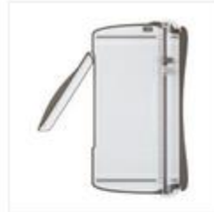
Stampin' Trimmer - 126889