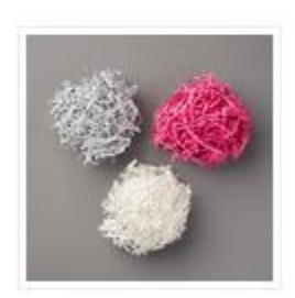
Sweet Soirée Ready Shreddie -145562