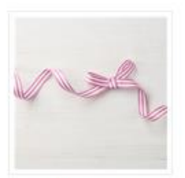
Sweet Sugarplum 3/8" Striped Grosgrain Ribbon - 144229