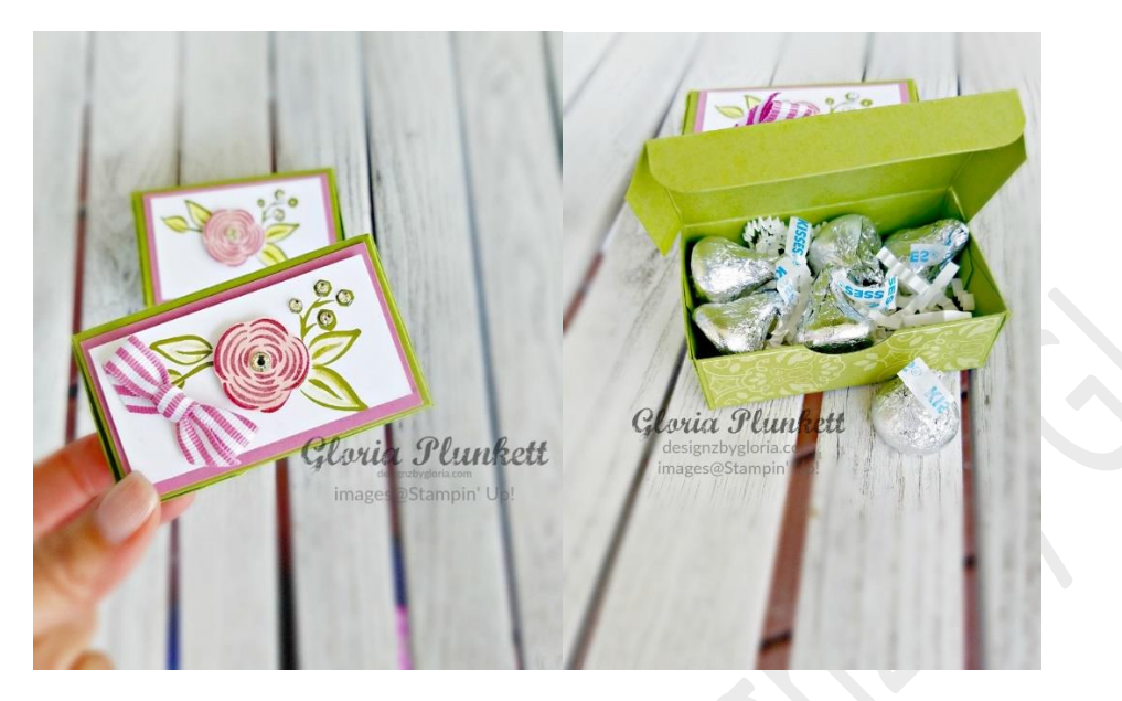
Super quick, and fun treat box!