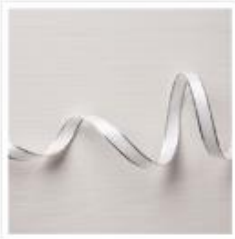
Silver 3/8" Metallic-Edge Ribbon - 144213