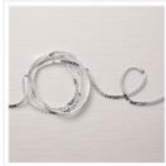
Silver Mini Sequin Trim - 144230