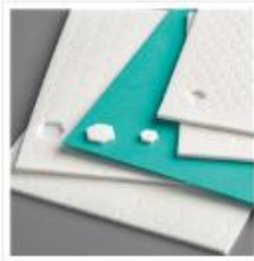
Mini Stampin' Dimensionals - 144108