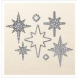
Starlight Thinlits Dies - 141840 Price: $29.00