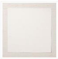
Sparkle Glimmer Paper - 146957 Price: $5.00