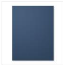
Night Of Navy 8- 1/2" X 11" Cardstock - 100867 Price: $8.50