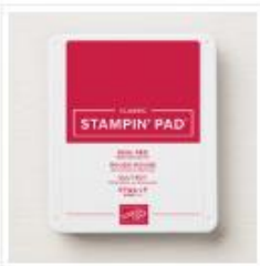
Real Red Classic Stampin' Pad - 147084