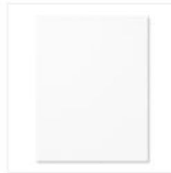
Whisper White 8- 1/2" X 11" Cardstock - 100730 Price: $9.75