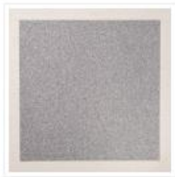
Silver Glimmer Paper - 146960 Price: $5.00