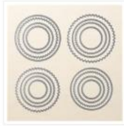
Layering Circle Framelits Dies - 141705 Price: $35.00