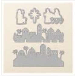
Bethlehem Edgelits Dies - 144676 Price: $32.00