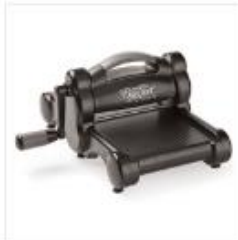
Big Shot - 143263