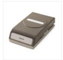
Classic Label Punch - 141491 Price: $18.00