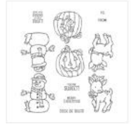
Seasonal Chums Wood-Mount Stamp Set - 144945 Price: $29.00