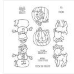
Seasonal Chums Clear-Mount Stamp Set - 144948 Price: $21.00