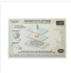
Magnetic Platform - 130658